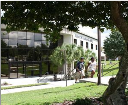
Pasco-Hernando Community College, Dade City Campus

Companies interested in job training may consider several institutions in the area. Pasco-Hernando Community College has two locations in Pasco County, including one in nearby Dade City and another planned to open in Wesley Chapel; there also is a PHCC campus in Brooksville, just north in Hernando County. PHCC enrolls nearly 16,000 students and provides training for more than 40 careers in healthcare, computer engineering, law, business and human services.