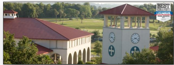
Saint Leo University, Saint Leo Campus

The School of Business offers a complete menu of business concentrations. Students can choose from more than 40 majors and specializations, plus graduate degrees in business administration, education, teaching, criminal justice and theology. The Center for Online Learning at Saint Leo helps meet the growing needs of many of the university's adult students.