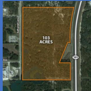
SOFTWIND INDUSTRIAL PARK