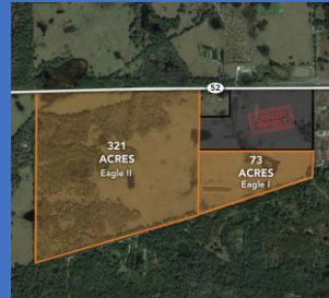
EAGLE I & II INDUSTRIAL PARKS