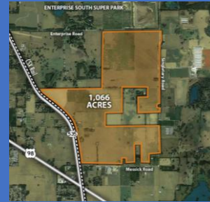
ENTERPRISE SOUTH SUPER PARK