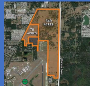
ZEPHYRHILLS AIRPORT INDUSTRIAL PARK