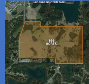
HAYS ROAD INDUSTRIAL PARK